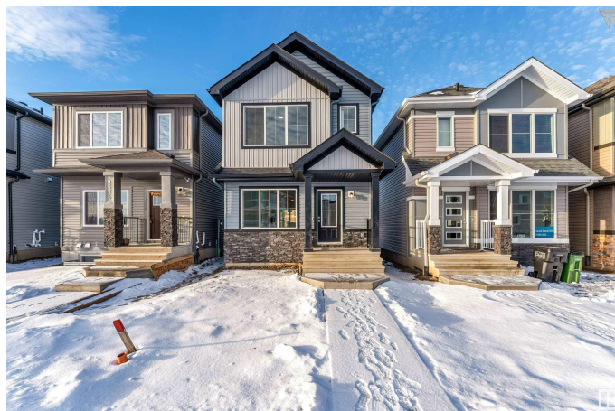
9574 Carson Bnd SW, Edmonton, AB

MLS® # E4416797 Price $485,000 Bedrooms 3 Bathrooms 2.50